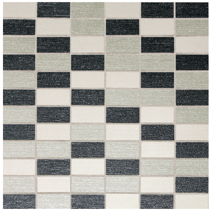
COOL BLEND P267 MOSAIC (2)