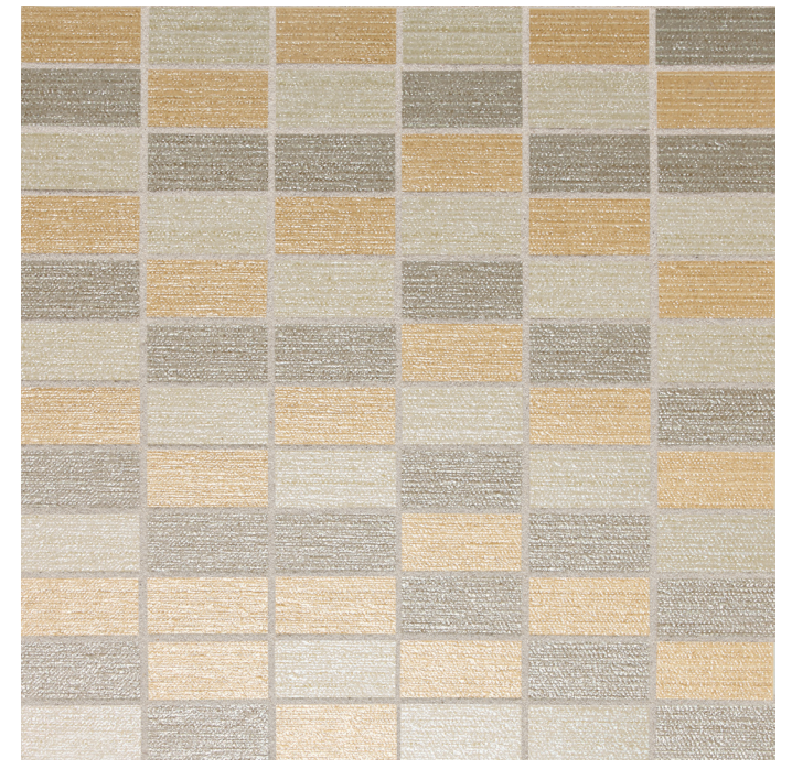
WARM BLEND P268 MOSAIC (1)