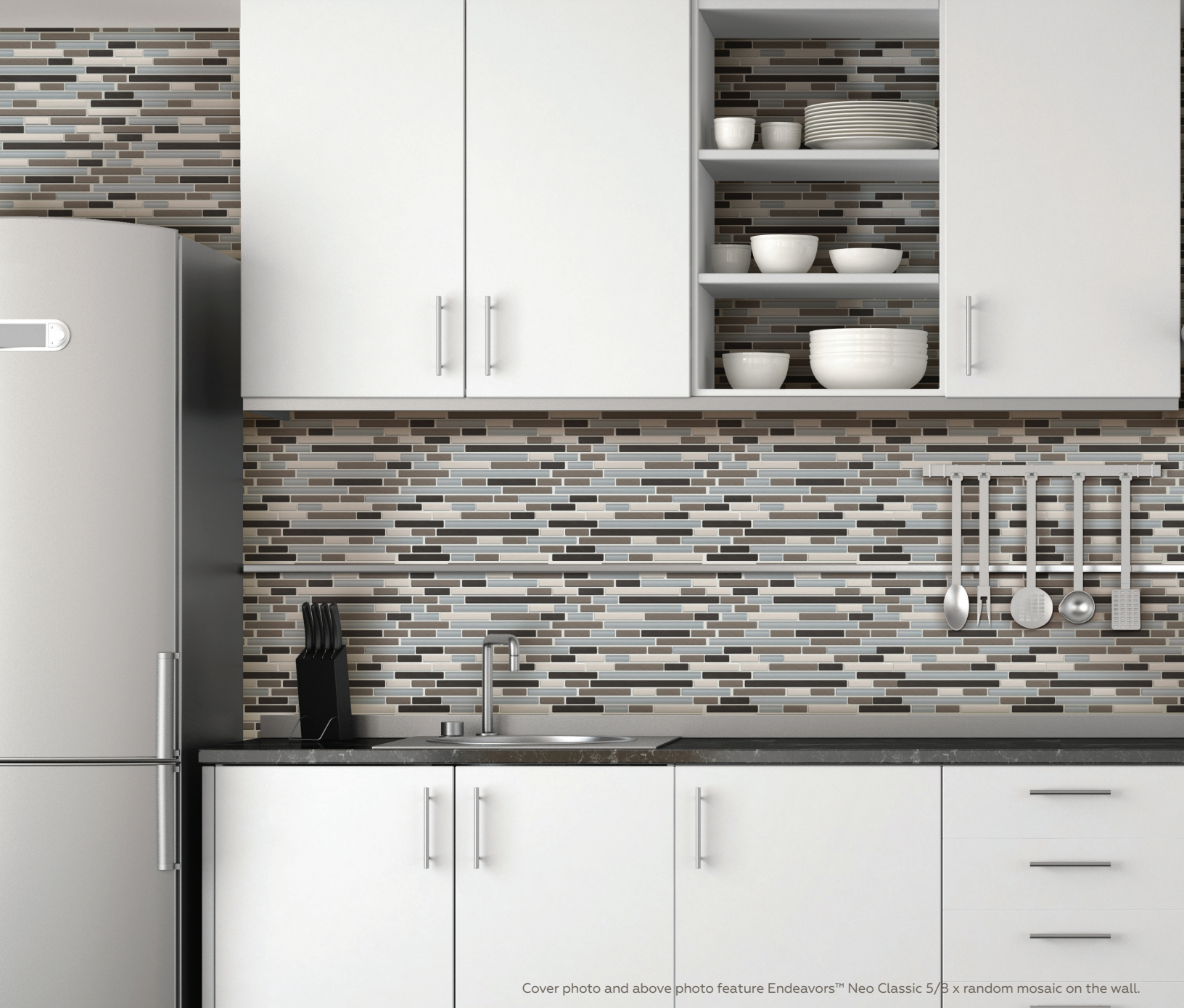
Cover photo and above photo feature Endeavors™ Neo Classic 5/8 x random mosaic on the wall.