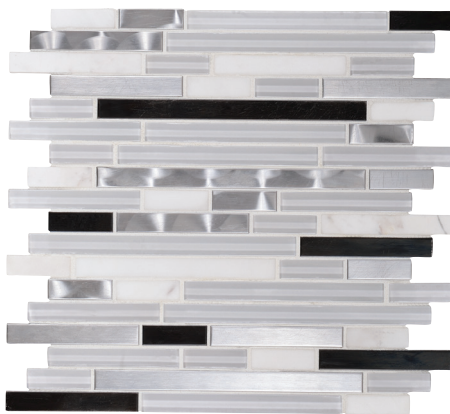
NEO CLASSIC F164