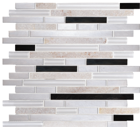
AVANT GARDE F163