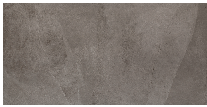
LIGHT GREY DL26*