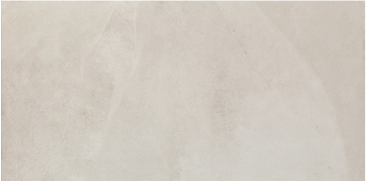
OFF WHITE DL25