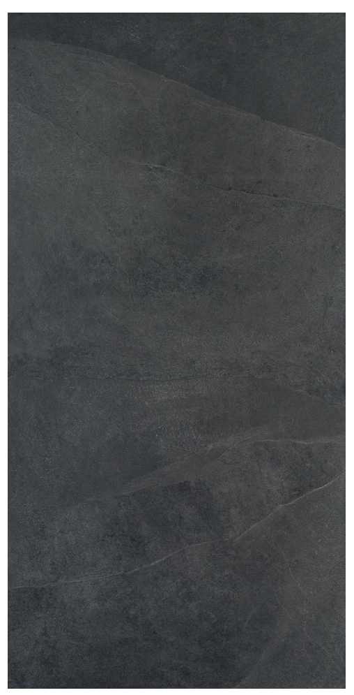
DARK GREY DL27