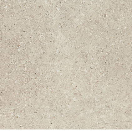
NOTABLE BEIGE DR09

VISIT THE WHY TILE PAGE AT WWW.DALTILE.COM FOR A COMPLETE LIST OF QUALIFICATIONS AND EXCLUSIONS.