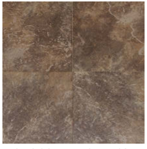
MOROCCAN BROWN CS55