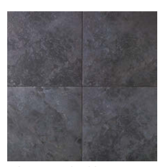
ASIAN BLACK CS53