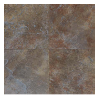
TUSCAN BLUE CS56