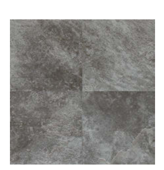
ENGLISH GREY CS57