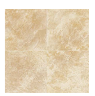
PERSIAN GOLD CS54