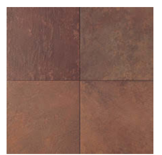
INDIAN RED CS51