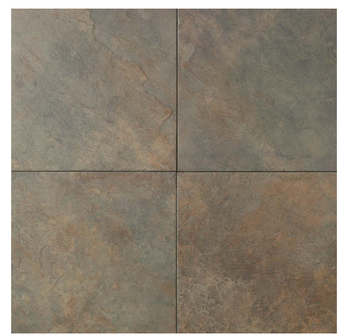
BRAZILIAN GREEN CS52