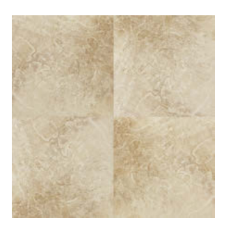
EGYPTIAN BEIGE CS50