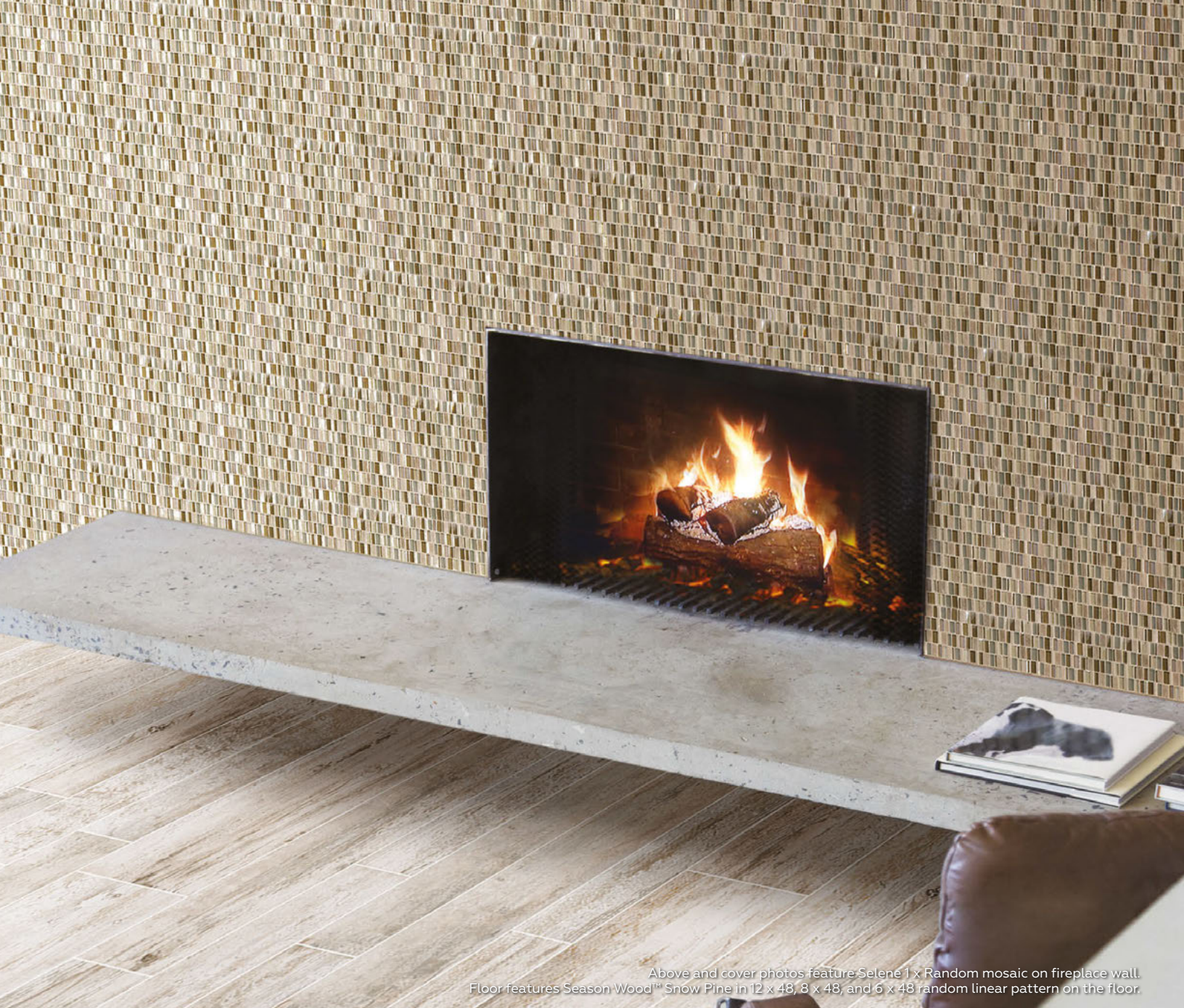
Above and cover photos feature Selene 1 x Random mosaic on fireplace wall. Floor features Season Wood™ Snow Pine in 12 x 48, 8 x 48, and 6 x 48 random linear pattern on the floor.