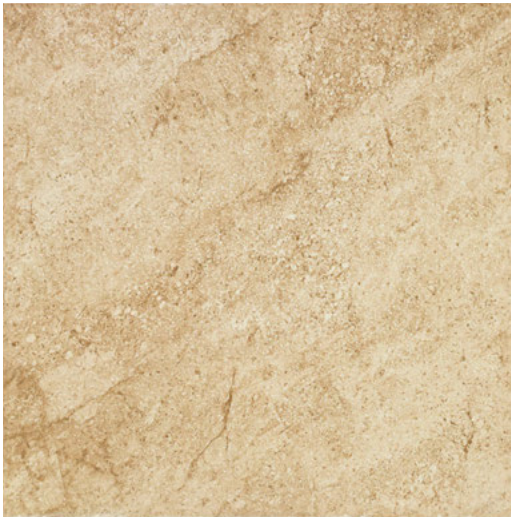
LIGHT NOCE CA21