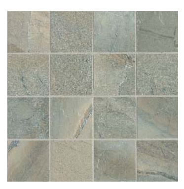
MAJESTIC MOUND AY04