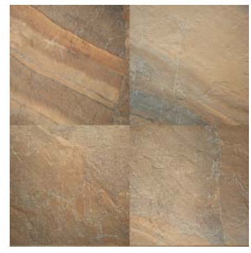
BRONZED BEACON AY03