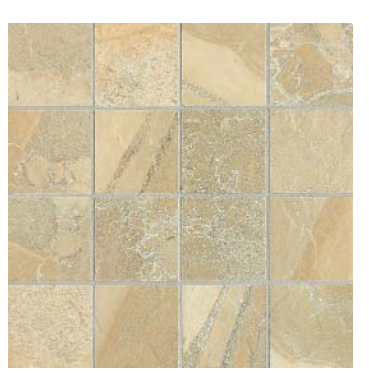
GOLDEN GROUND AY02