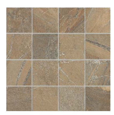
BRONZED BEACON AY03