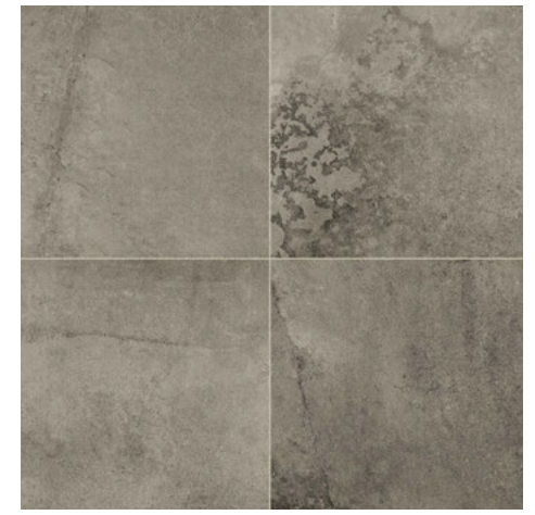
META DARK GRAY SA07