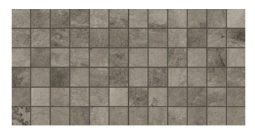
META DARK GRAY SA07