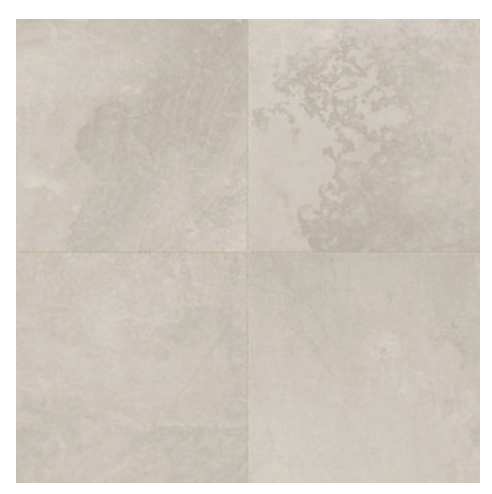
META LIGHT GRAY SA06