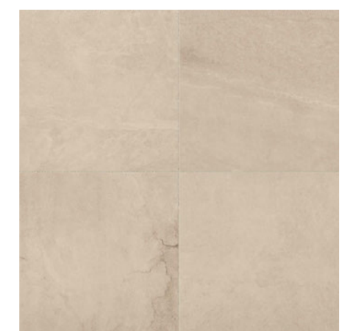
META BEIGE SA05