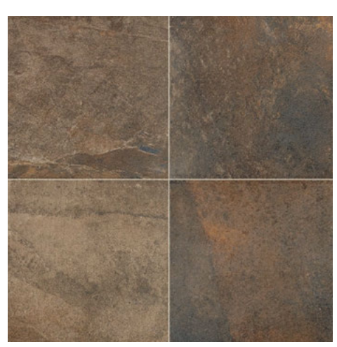
MULTI BROWN SA08*