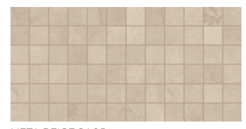
META BEIGE SA05