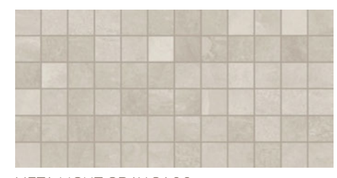
META LIGHT GRAY SA06