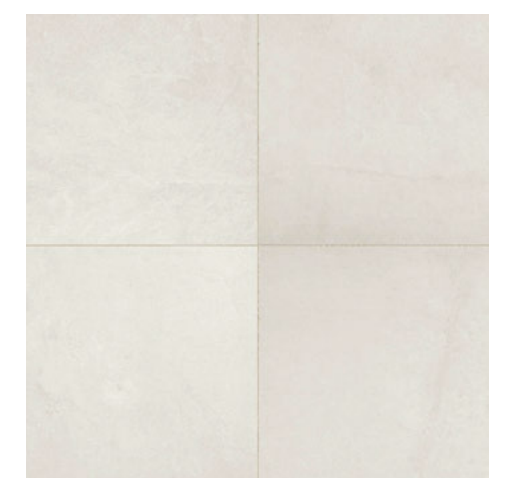
META WHITE SA04