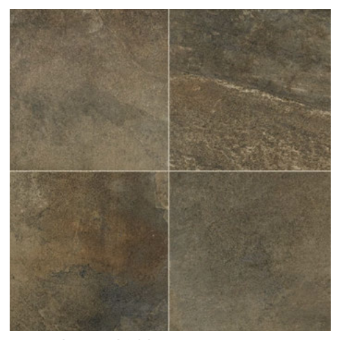
MULTI GREEN SA09*