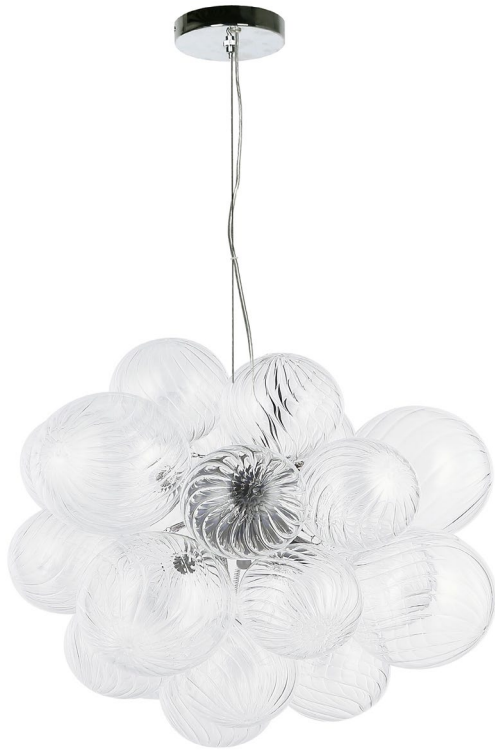
6 Light Halogen Pendant Polished Chrome with Clear Spiral Glass

Height 20 Width/Length 20 Depth 20 Weight 6.5