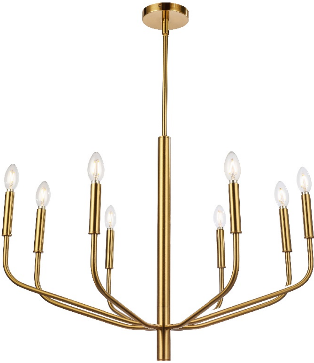
8 Light Incandescent Chandelier, Aged Brass