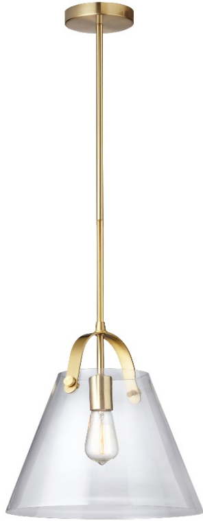
1 Light Incandescent Pendant Aged Brass Finish with Clear Glass