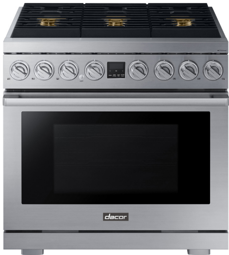
DOP36T86GLS/DA - Silver Stainless, Natural Gas