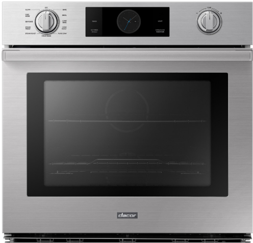
DOB30T977SS/DA - Silver Stainless