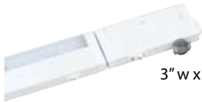
3" w x 6" L x ¾" H