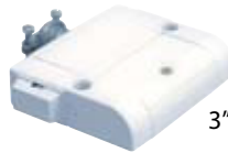
3" w x 3½" L x ¾" H

controls multiple units from one switch, when installed at beginning of run