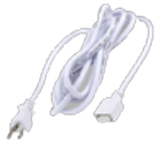
Portable 8' Cord Plug, Back or White