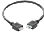
SpeedLink Interlink Cables Available in 10" and 18" lengths, Black or White