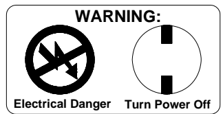
Drawing ( 1 )