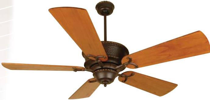
Aged Bronze Riata with 54" Premier Distressed Teak Blades

Model-Finish RT52AG Blade-Finish B554PD-TK7 Light-Finish Not Shown