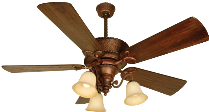
Burnt Sienna Riata with 54" Premier Distressed Walnut Blades

Model-Finish RT52PT Blade-Finish B556C-SB4 Light-Finish Not Shown