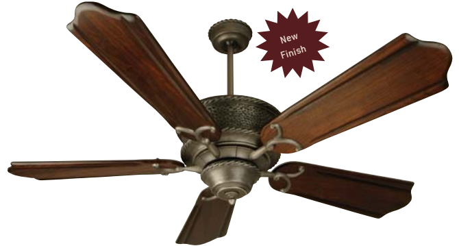
Pewter Riata with 56" Custom Carved Classic Ebony Blades

Model-Finish RT52AG Blade-Finish B554PD-TK7 Light-Finish Not Shown