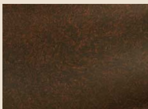
AG Aged Bronze