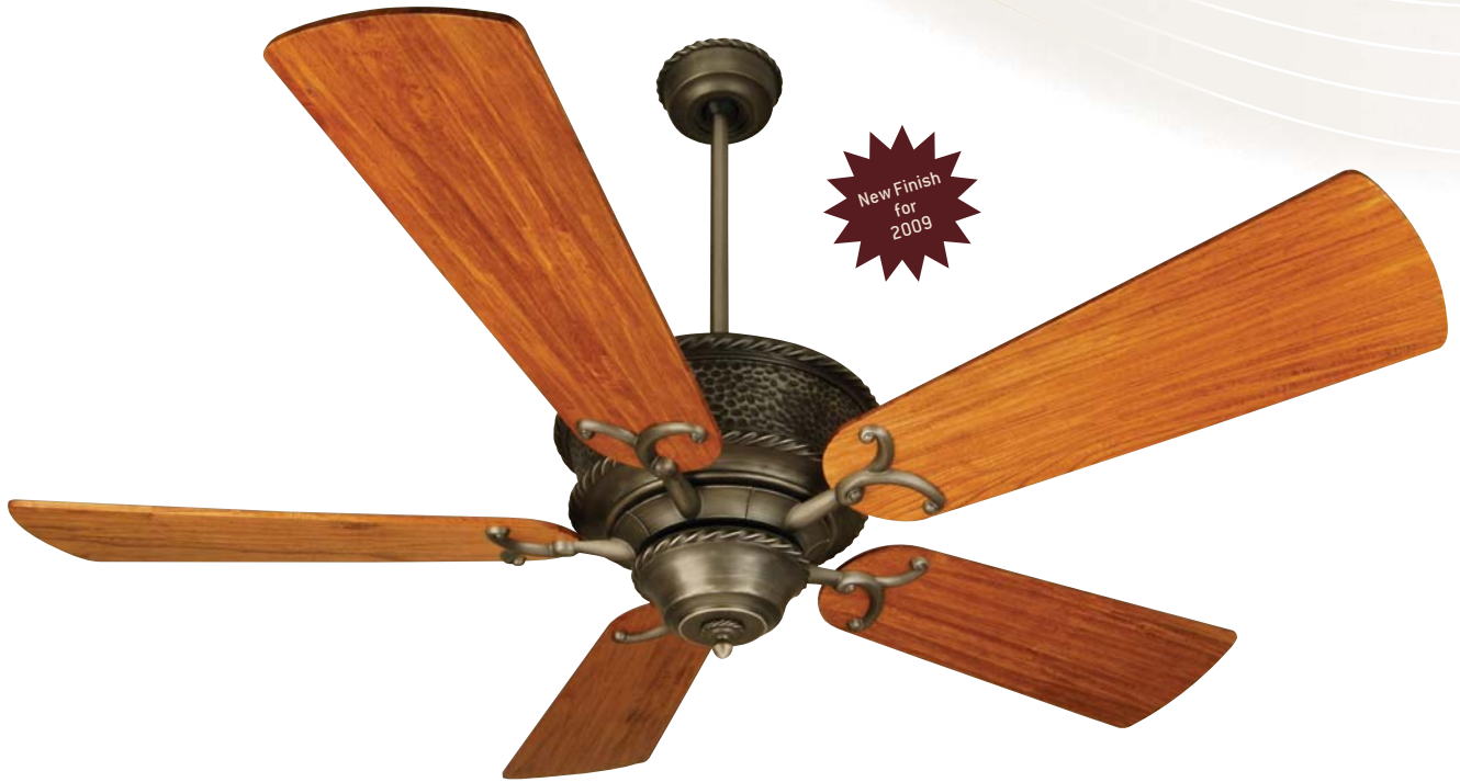
Pewter Riata with 54" Premier Distressed Oak Blades

A classic showpiece, the Riata fan is an attractive addition to your home.