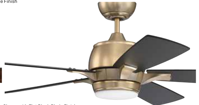
Shown with Flat Black Blade Finish

A Oiled Bronze 52" Stellar Model . . . . . STE52OB5 Blade . . . . . Oiled Bronze/Walnut Light . . . . . Integrated, White Frost Glass