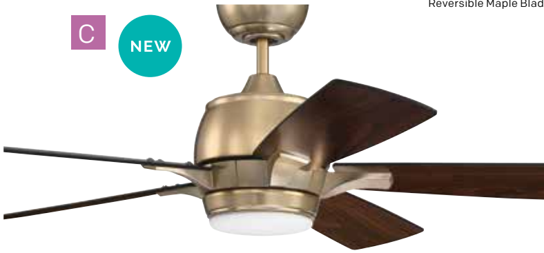
Shown with Walnut Blade Finish