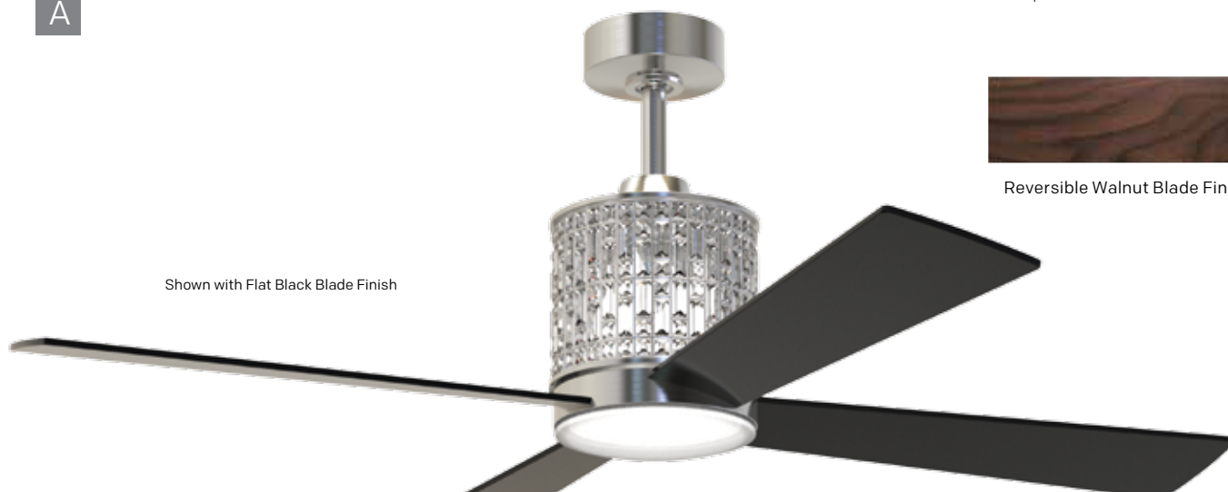
Shown with Flat Black Blade Finish