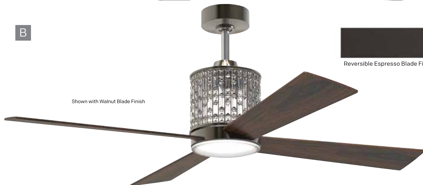
Shown with Walnut Blade Finish