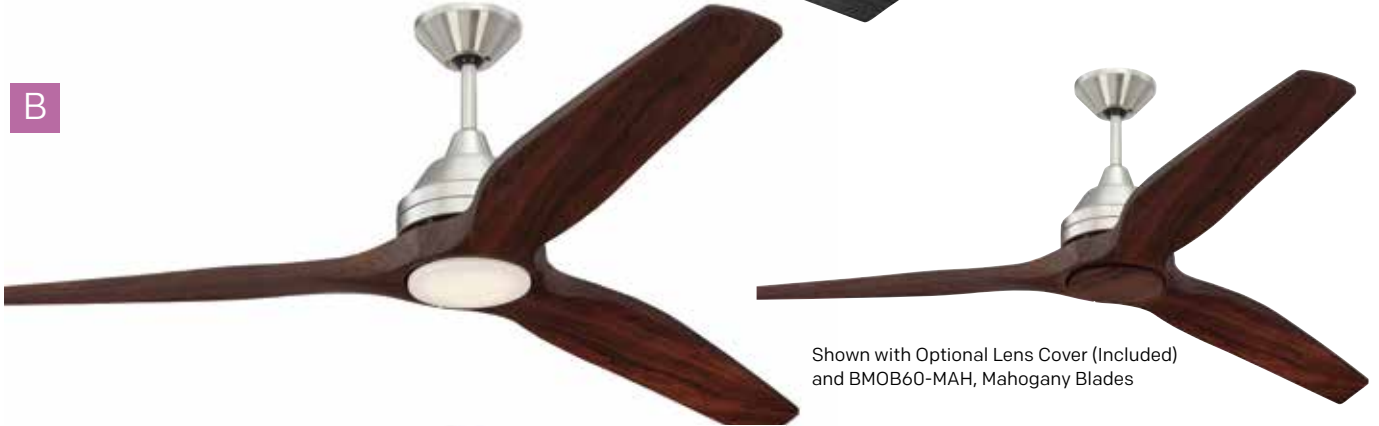
Shown with Optional Lens Cover (Included) and BMOB60-MAH, Mahogany Blades