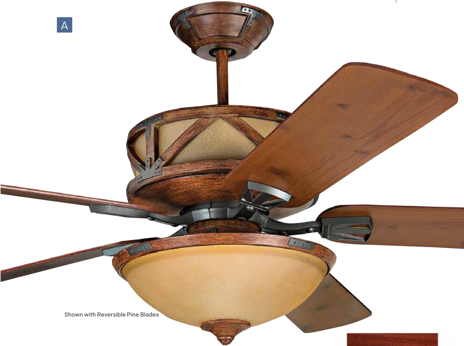
Shown with Reversible Pine Blades