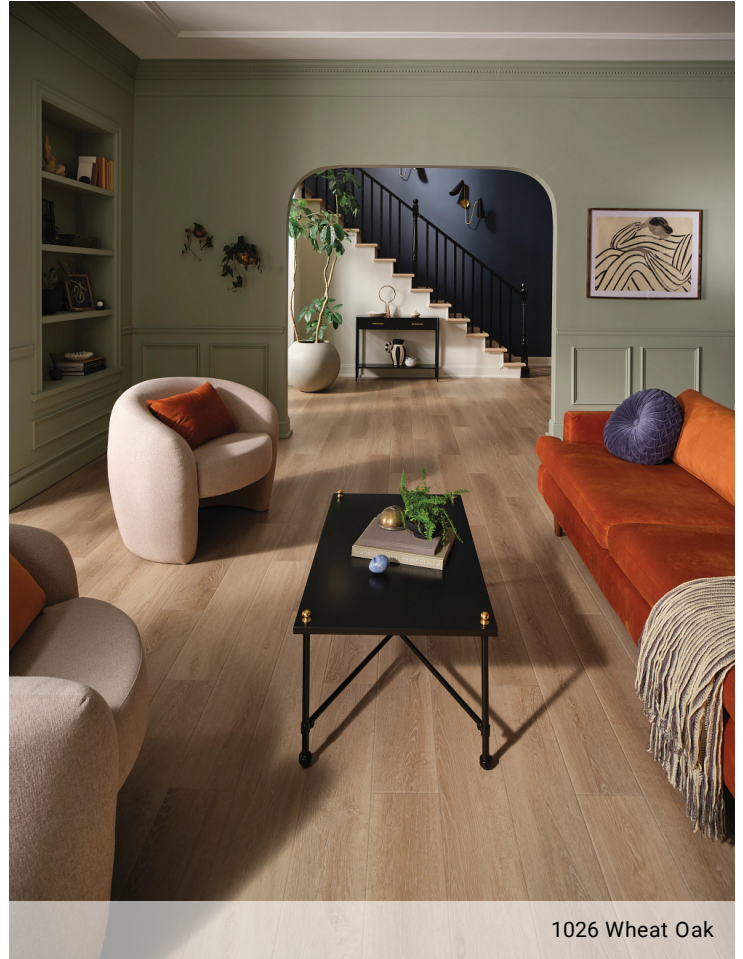
1026 Wheat Oak