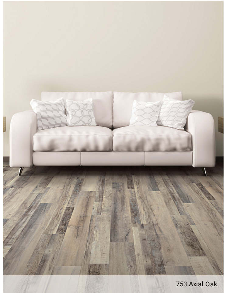
753 Axial Oak