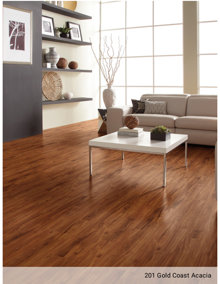
201 Gold Coast Acacia