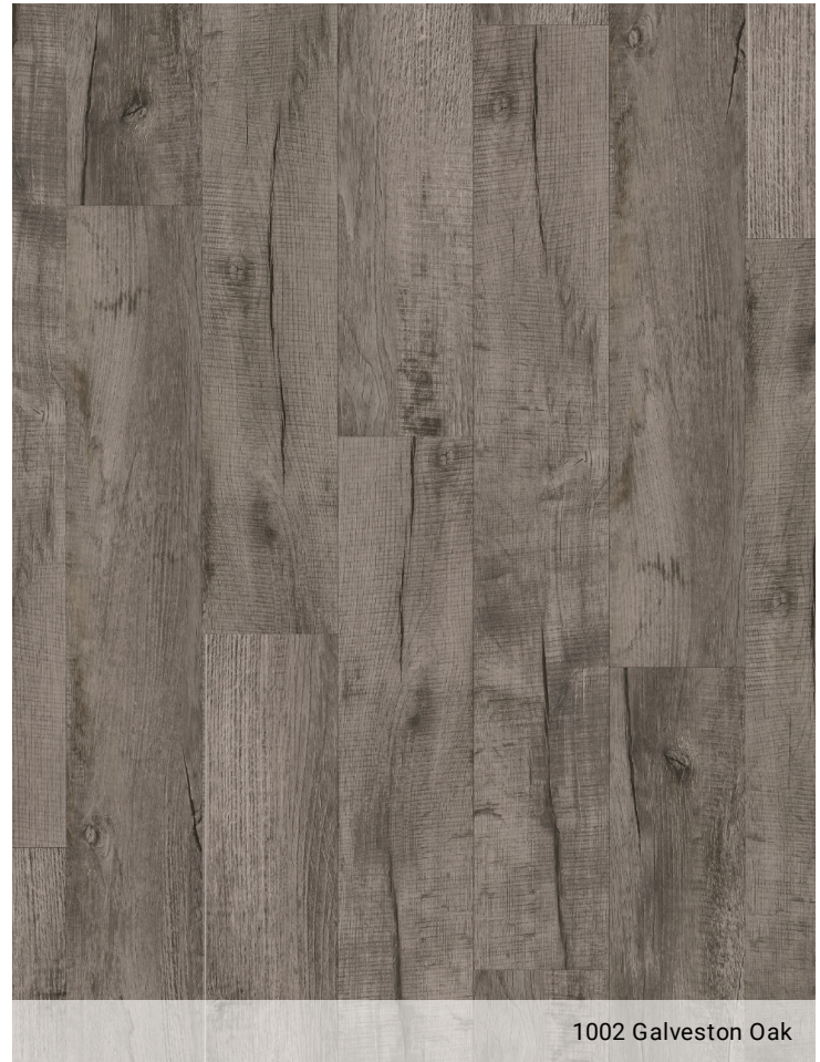
1002 Galveston Oak