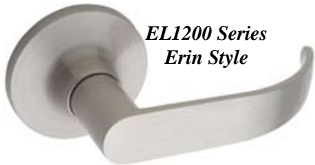
EL1200 Series Erin Style