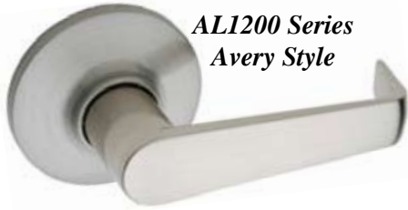
AL1200 Series Avery Style