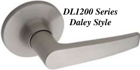
DL1200 Series Daley Style