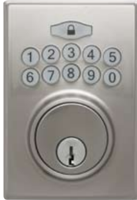
DBF Single Cylinder Deadbolt