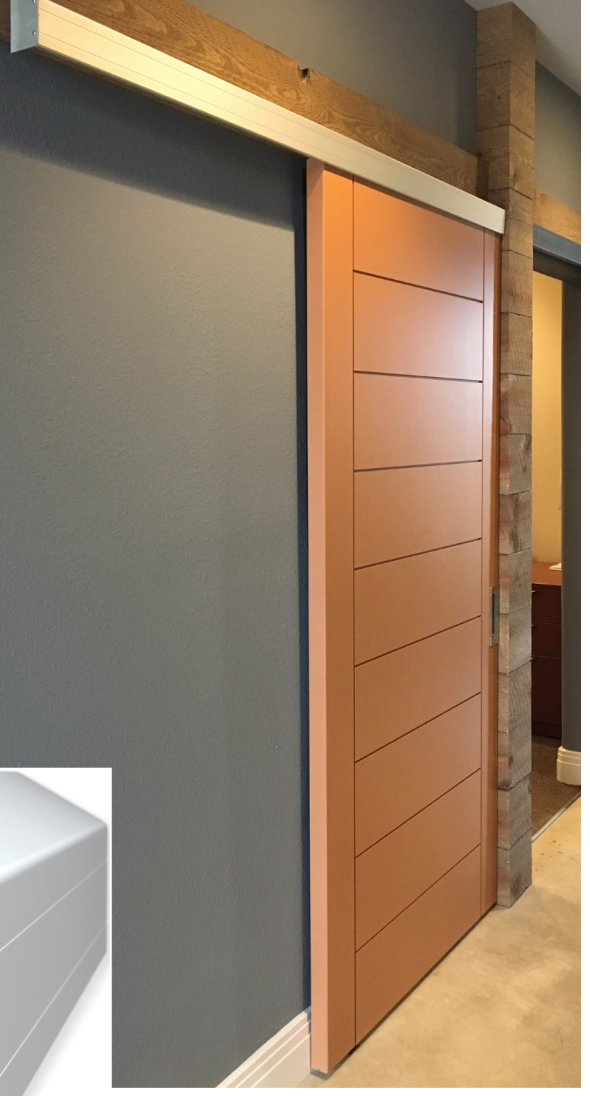
CS WallMountTrack with clear anodized finish.

Installation is quick and easy as the track is supplied with premachined fixing slots. The track also comes with a pre-finished, removable aluminum fascia and end caps that neatly conceal the top of the door, track and carriage system.