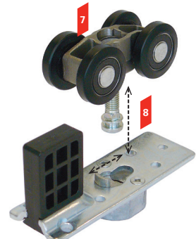
M8 carriage & mounting plate with stop