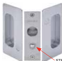
CONFIGURATION E Passage with Striker For use only with Bi-Parting doors to match the Privacy A Configuration (Both Sides Blank)