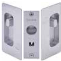
CONFIGURATION A Privacy Snib Both Sides or Snib / Emergency (option when fitting)