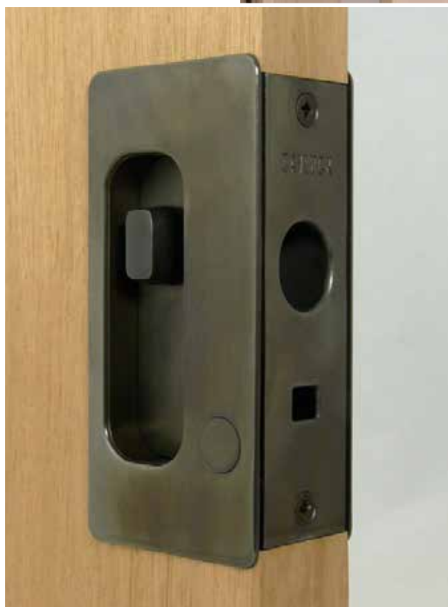
A CaviLock CL200 Privacy handle in oil rubbed bronze.