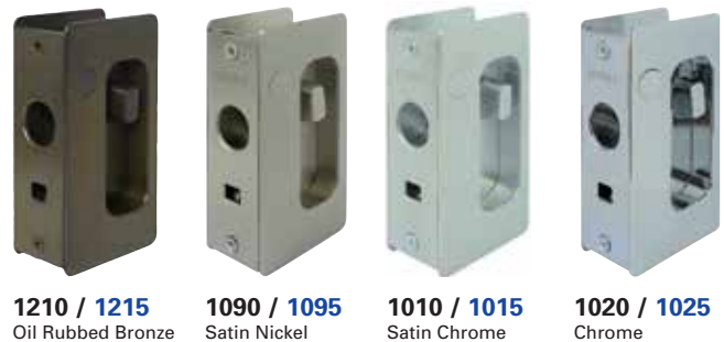
1210 / 1215 Oil Rubbed Bronze 1090 / 1095 Satin Nickel 1010 / 1015 Satin Chrome 1020 / 1025 Chrome

Other finish options available on request. (Note: Longer lead times and additional surcharges may apply.)