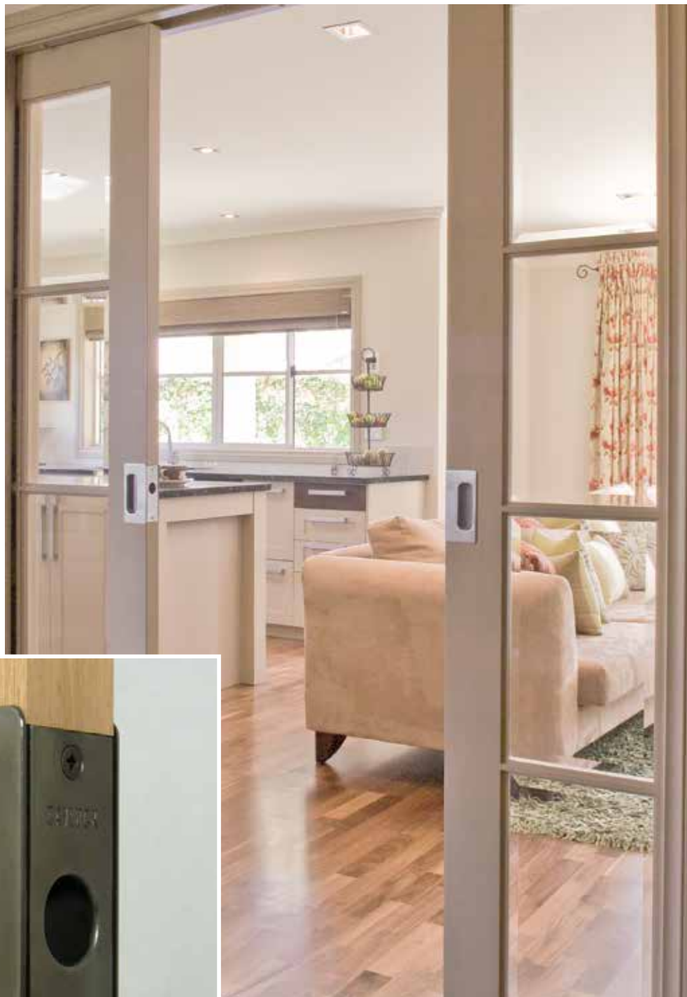
Bi-Parting pocket doors with CL200 Passage handles in satin chrome.

The front face plate on the CL200 incorporates a recessed edge-pull to allow the door to be withdrawn from the pocket when fully open. The CL200's deep recessed side pulls make even heavy doors easy to slide.