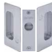
CONFIGURATION D Passage - Both Sides Blank