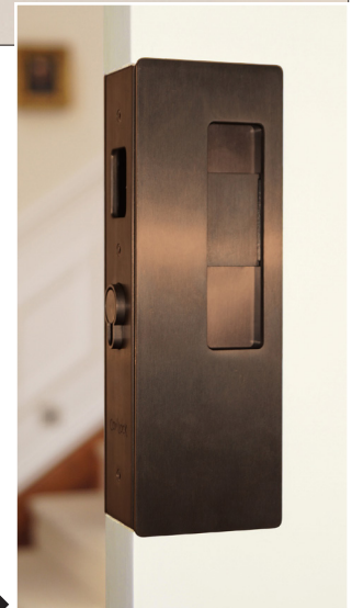
7 - CL400 Key/Snib option. Oil Rubbed Bronze finish.