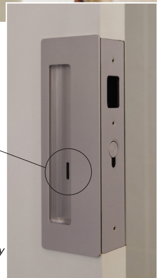
5 - CL400 Privacy - Emergency Release/Snib option. Matte Chrome finish.

Emergency Release can be activated with a pen in an emergency.