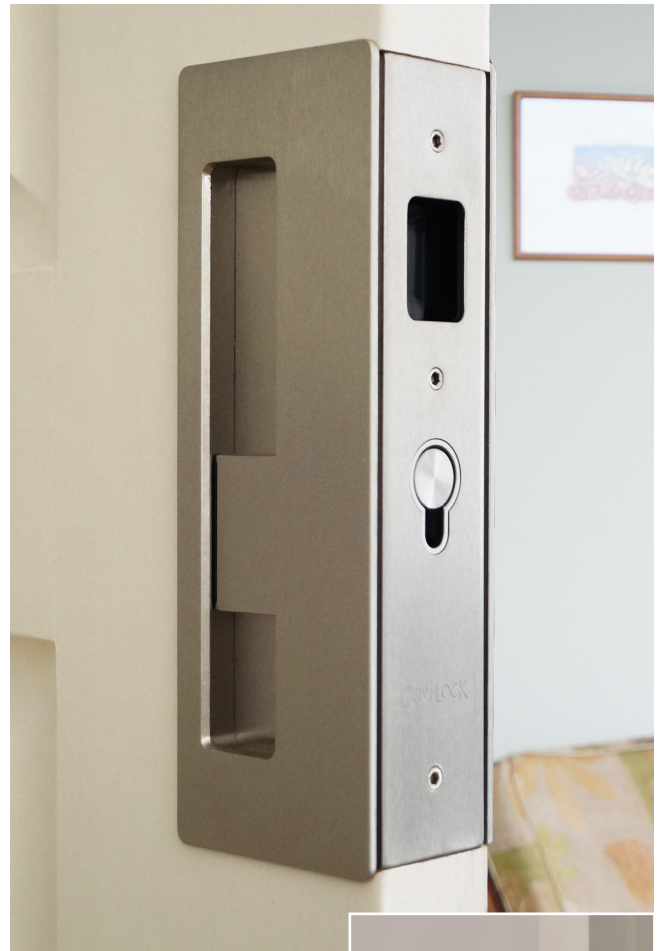
4 - CL400 Privacy Snib/ Snib option. Satin Nickel finish.