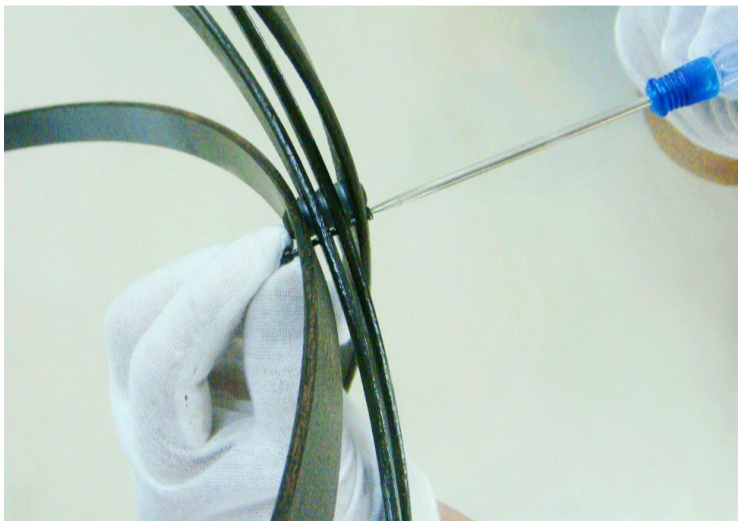
Orb Assembly Step-3