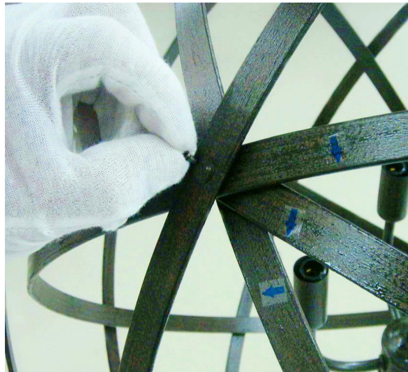
Orb Assembly Step-2