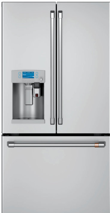
CYE22UP2MS1 Stainless Steel with Brushed Stainless handles