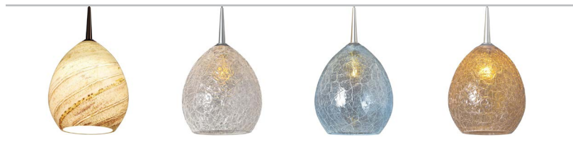
881 sea shell 885 ice 886 glacier 887 champagne

DESCRIPTION Bruck's European and American Artisan, mouth-blown glass is known throughout the world for its quality and beauty. Several light source options, mounting options, colors and finishes allow for a unique design. Most of Bruck's mini-pendant glass allows for easy screw-on/screw-off for a simple installation or design change. Pendant L70 is 145,000 hours of operation.