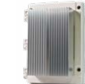
Affinity Dimmer Series