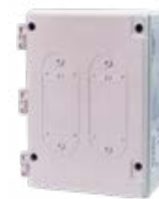
Affinity Smart-Heat On/Off Series