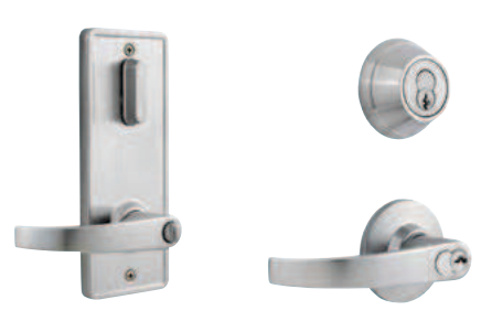
Summit (M) - Double-Locking