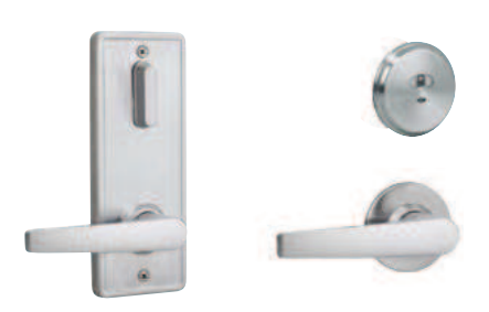
Slate (A) – Indicator