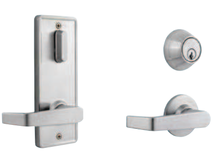
Sierra (E) – Single-Locking

· Lifetime Mechanical, 3-year finish* and 1-year electrical