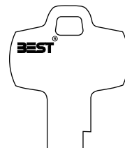
KS594 Key Stamp Alternative front key stamp for Premium keys*

Keys can be personalized to an institution or organization. In addition to making them easier to identify, key stamping protects them against unauthorized duplication. Key stamping is provided for a one-time fee.