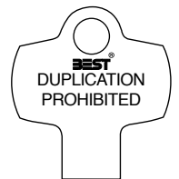
KS208 Key Stamp Alternative front key stamp for Standard keys