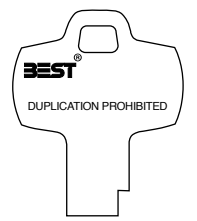
KS609 Key Stamp Alternative front key stamp for Premium keys*