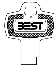
KS567 Key Stamp Standard front key stamp for Premium keys*