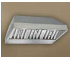
The Custom Hood Liner easy install system comes with liner, blower, filtration, controls, lighting and damper.