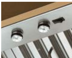
Rotary controls for two-level lighting and variable blower speeds enable the user to choose operating preferences.