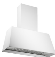
KMC30BI Matt white canopy