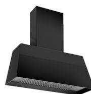
KMC30NE Matt black canopy