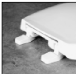
"LOCKED-IN" TOP-TITE® HINGE

Ring thickness is 1/2" Ring thickness including the bumper is 13/16" Height of the seat with cover is 1-7/8"