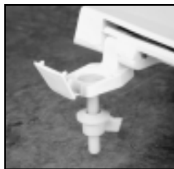
TOP-TITE® HINGES FEATURE NO-SLIP WASHER