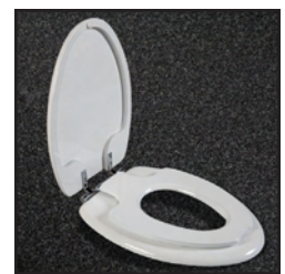
INTEGRATED CHILD TRAINING SEAT