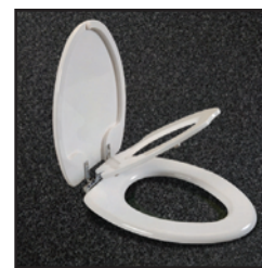
CHILD SEAT SECURES MAGNETICALLY INTO COVER WHEN NOT IN USE

Ring thickness is 3/4" Ring thickness with Bumper 1-1/8" Height of the seat with cover is 2-1/4" Child Seat Hole Length 7-3/8" Child Seat Hole Width 6-1/8"