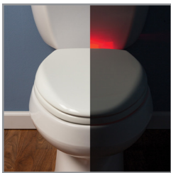
iLumaLight™ 8-HOUR NIGHT LIGHT