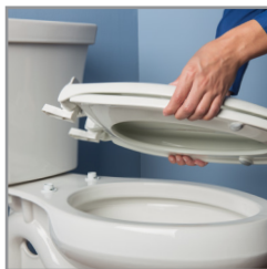
EASY REMOVAL OF SEAT FOR THOROUGH CLEANING