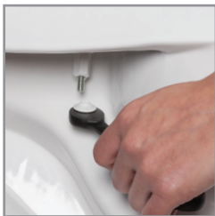
STA-TITE® SEAT FASTENING SYSTEM™