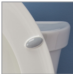
SUPER GRIP BUMPERS™