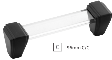
C 96mm C/C