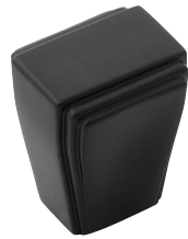
A 1" LENGTH