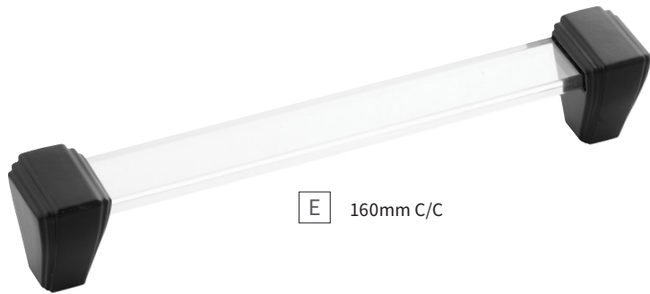
E 160mm C/C