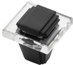
B 1-1/4" SQ.