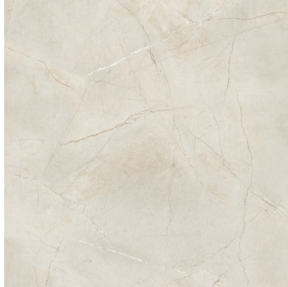
Crema Marfil 100005418 - 48"x48" Field Tile - Polished 100005417 - 48"x48" Field Tile - Satin