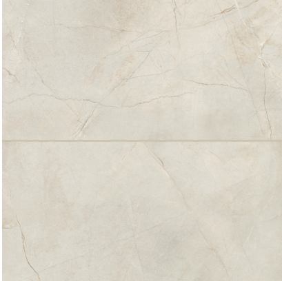
Crema Marfil 100005416 - 24"x48" Field Tile - Polished 100005415 - 24"x48" Field Tile - Satin