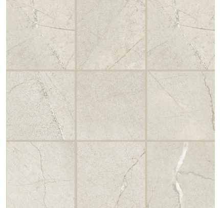
Crema Marfil 100005982 4"x4" Mosaic - Satin (12"x12" Sheet)