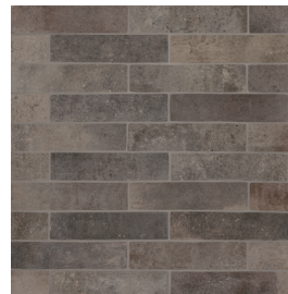
Rock Creek 100004013