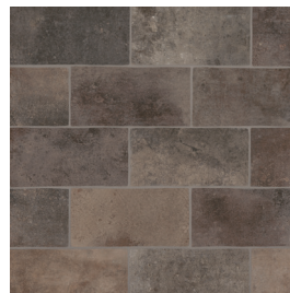
Rock Creek 100004020