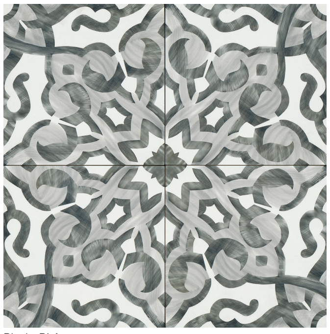
Black - BLA LOEVIAGIABLA10M - 10"x10" Matte