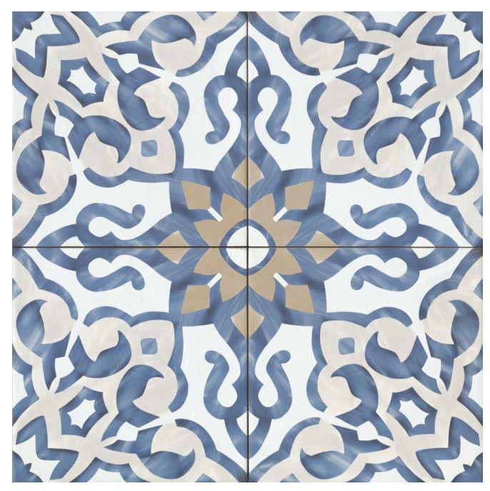
Blue - BLU LOEVIAGIABLU10M - 10"x10" Matte