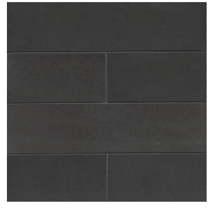
GRNABSBLK0312H 3"x12" Honed