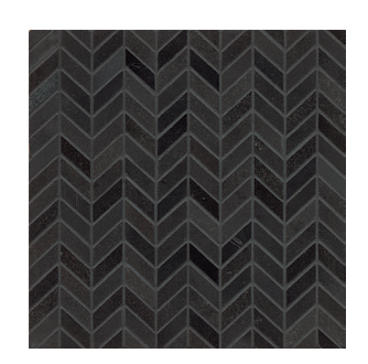
GRNABSBLKCHE Chevron Mosaic Polished