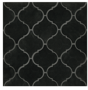
GRNABSBLKARB-P Arabesque Mosaic Polished