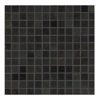
GRNABSBLK0101P 1"x1" Mosaic Polished