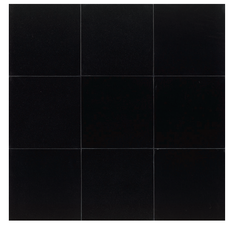
GRNABSBLK1212H - 12"x12" Honed GRNABSBLK1212P - 12"x12" Polished GRNABSBLK1224F - 12"x24" Folished GRNABSBLK1224P - 12"x24" Polished GRNABSBLK1818F - 18"x18" Flamed GRNABSBLK1818H - 18"x18" Honed GRNABSBLK1818P - 18"x18" Polished GRNABSBLK2424P - 24"x24" Polished