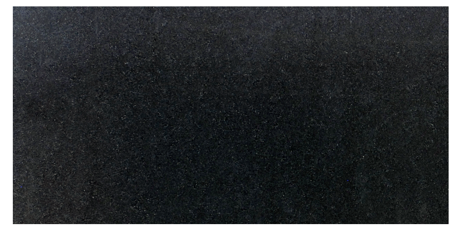
GRNABSBLKSLAB2F - 2 cm Slab Flamed GRNABSBLKSLAB2H - 2 cm Slab Slab Honed GRNABSBLKSLAB2P - 2 cm Slab Polished GRNABSBLKSLAB2PH - 2 cm Slab Polished & Honed GRNABSBLKSLAB2L - 2 cm Slab Leathered GRNABSBLKSLAB3P - 3 cm Slab Polished GRNABSBLKSLAB3PH - 3 cm Slab Polished GRNABSBLKSLAB3PH - 3 cm Slab Leathered