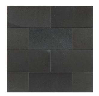
GRNABSBLK0306H 3"x6" Honed