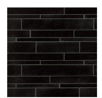
GRNABSBLKLNR Random Linear Mosaic Polished