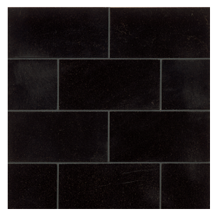
GRNABSBLK0306P 3"x6" Polished