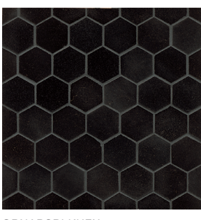
GRNABSBLKHEX Hexagon Mosaic Polished