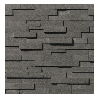
GRNABSBLKLED 6"x24" Flamed Ledger