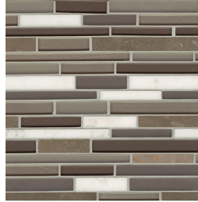
MacArthur - GRM GLSMANGRRMISGMCB Random Interlocking - Gloss/Matte (12"x13" Sheet)