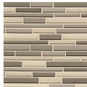
Fifth Avenue - FAV GLSMANFAVRIGMCB Random Interlocking - Gloss/Matte (12"x13" Sheet)