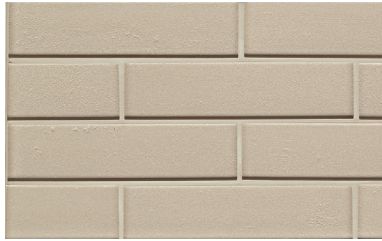
Silk - SIL