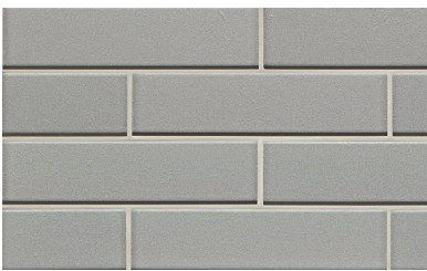
Platinum - PLA