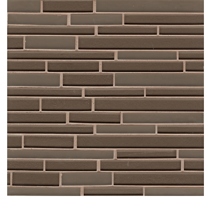
GLSMAN***RIGMC Random Interlocking Glass - Gloss/Matte Combo (12"x13" Sheet)