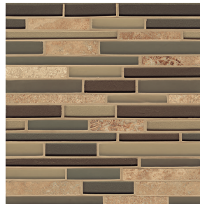
Chelsea - CHE GLSMANCHERISGMCB Random Interlocking - Gloss/Matte (12"x13" Sheet)