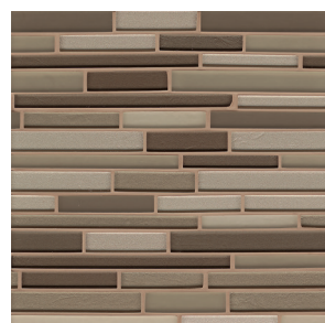
Soho - SOH GLSMANSOHRIGMCB Random Interlocking - Gloss/Matte (12"x13" Sheet)