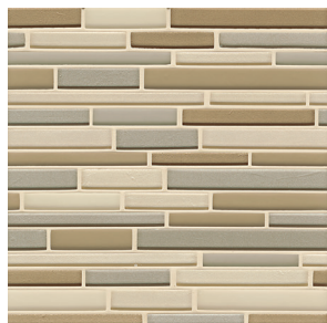
Time Square - TSQ GLSMANTSQRIGMCB Random Interlocking - Gloss/Matte (12"x13" Sheet)