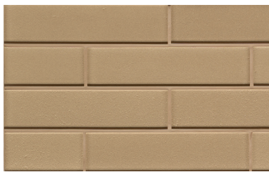
Heiress - HEI