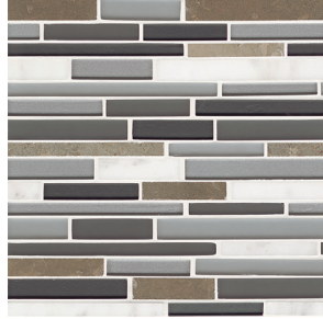
Long Island - LON GLSMANLONRISGMCB Random Interlocking - Gloss/Matte (12"x13" Sheet)