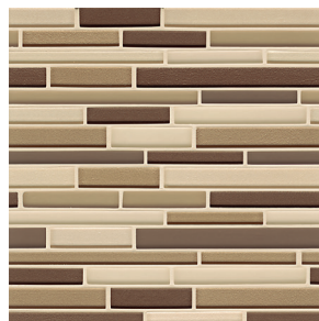
Plaza - PZA GLSMANPZARIGMCB Random Interlocking - Gloss/Matte (12"x13" Sheet)