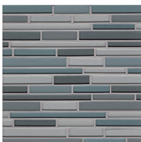
Hudson - HUD GLSMANHUDRIGMCB Random Interlocking - Gloss/Matte (12"x13" Sheet)