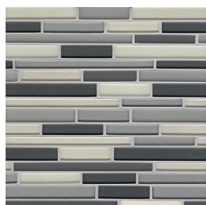
Broadway - BRD GLSMANBRDRIGMCB Random Interlocking - Gloss/Matte (12"x13" Sheet)