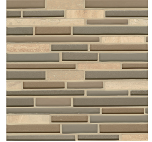
Battery Park - BAT GLSMANBATRISGMCB Random Interlocking - Gloss/Matte (12"x13" Sheet)