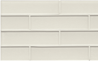
Pearl - PEA