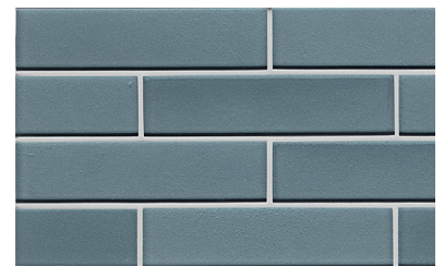
Subway - SUB