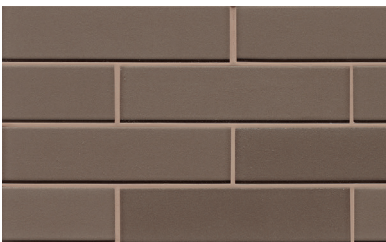
Ash - ASH