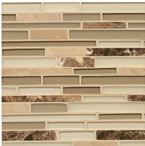
Midtown - MTW GLSMANMTWRISGMCB Random Interlocking - Gloss/Matte (12"x13" Sheet)