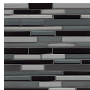
Wall Street - WST GLSMANWSTRIGMCB Random Interlocking - Gloss/Matte (12"x13" Sheet)