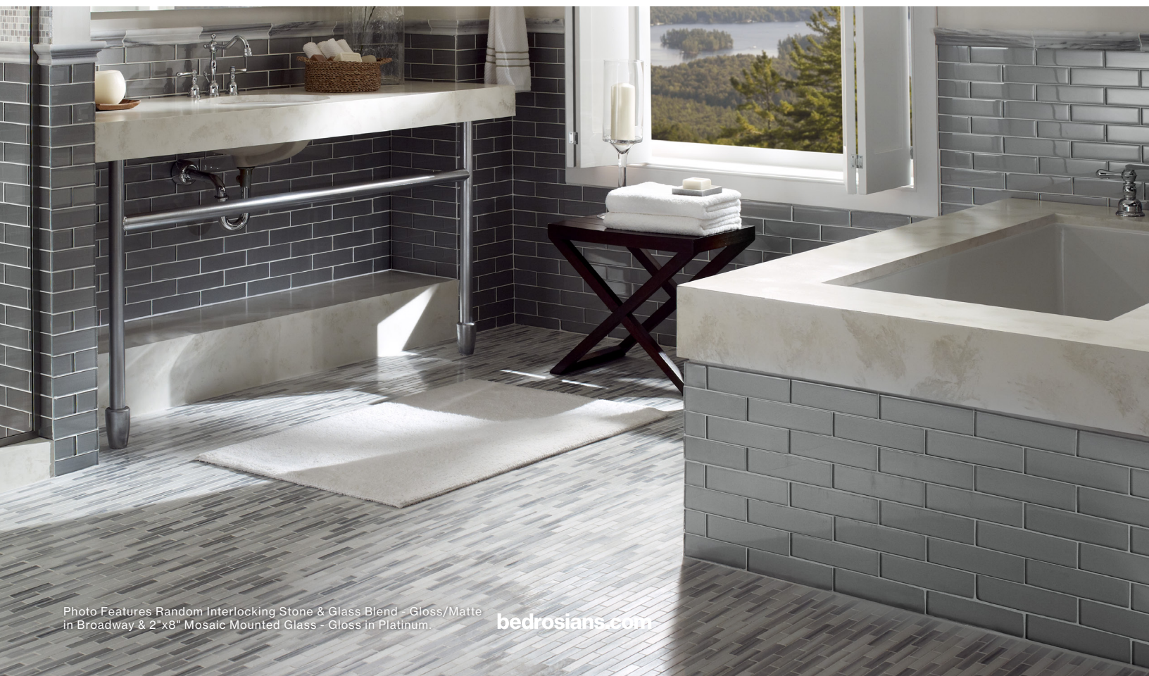
Photo Features Random Interlocking Stone & Glass Blend - Gloss/Matte in Broadway & 2"x8" Mosaic Mounted Glass - Gloss in Platinum.