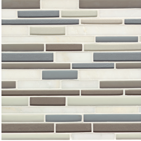
Riverside Park - RIV GLSMANRIVRISGMCB Random Interlocking - Gloss/Matte (12"x13" Sheet)