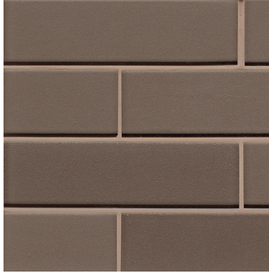
GLSMAN***28* 2"x8" Mosaic Mounted Glass - Gloss/Matte (8"x16" Sheet)