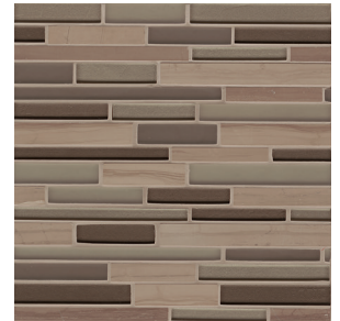
Flatiron - FLA GLSMANFLARISGMCB Random Interlocking - Gloss/Matte (12"x13" Sheet)