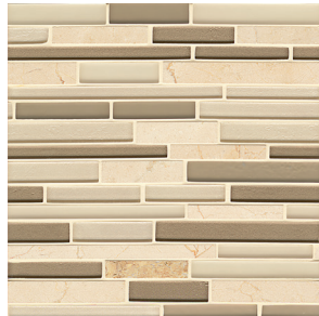
Morningside - MOR GLSMANMORRISGMCB Random Interlocking - Gloss/Matte (12"x13" Sheet)