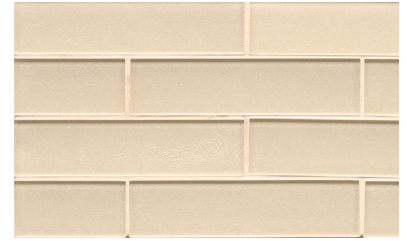
Cashmere - CAS