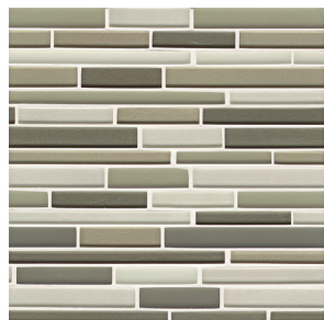
Central Park - CPK GLSMANCPKRIGMCB Random Interlocking - Gloss/Matte (12"x13" Sheet)