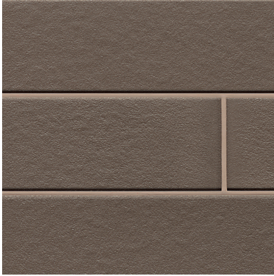
GLSMAN***416* 4"x16" Field Tile - Gloss/Matte