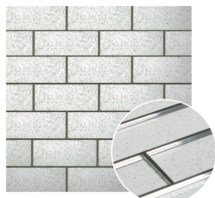
Princess - PRI GLSIMPPRI256 - 21/2"x6" Flat - Gloss