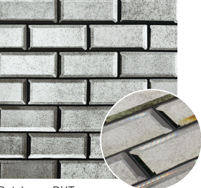
Dutchess - DUT GLSIMPDUT256BEV - 21/2"x6" Beveled - Gloss