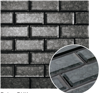
Duke - DUK GLSIMPDUK256BEV - 2 1/2"x6" Beveled - Gloss