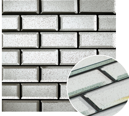
Princess - PRI GLSIMPPRI256BEV - 21/2"x6" Beveled - Gloss