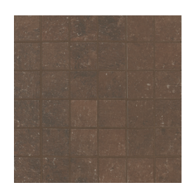
Grand Teton - GRA FLOROCGRA22MO