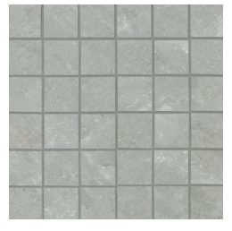
Half Dome - HAL FLOROCHAL22MO