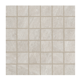
Mount Everest - MOU FLOROCMOU22MO