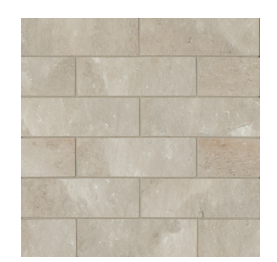
Trango Towers - TRA